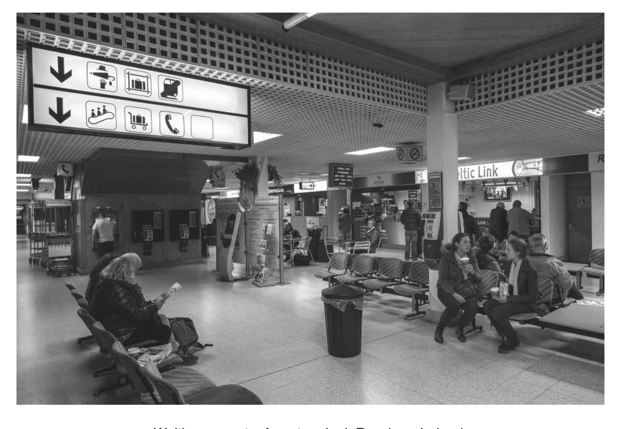
Waiting area at a ferry terminal, Rosslare, Ireland.